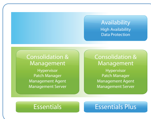
VMware vSphere Essentials editions

Both editions are all-inclusive packages that enable you to virtualize and consolidate many application workloads onto three physical servers (up to two processors each) running vSphere and centrally manage them with vCenter Server for Essentials. vSphere Essentials includes a one year license subscription. Support is optional and available on a per incident basis. vSphere Essentials Plus has several Support and Subscription (SnS) offerings that are sold separately. A minimum of one year of SnS is required.